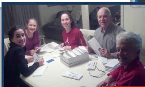
The WRGN Volunteer Crew preparing mailings for Share-A-Thon