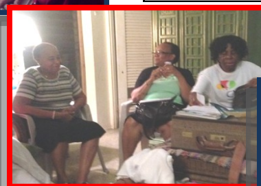
The "Friends of WIVH" planning details for Share-A-Thon