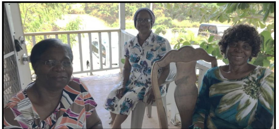
Phone central was a popular place during Share-A-Thon!