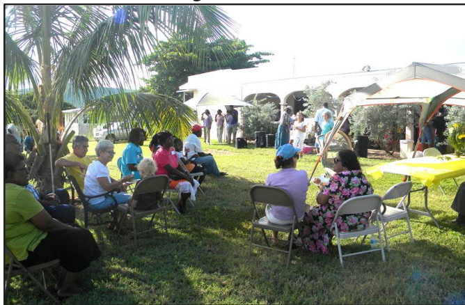
A lot of guests enjoyed the great fellowship at WIVH's Open House