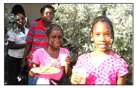
The children enjoyed face painting and, of course, the delicious food.