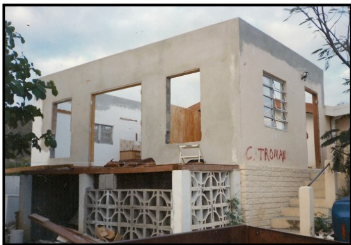
The future WIVH studios after Hurricane Hugo

WIVH is celebrating this month...25 years! What follows is a brief recap of the humble beginnings of the Virgin Islands Voice of Hope: